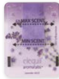
Lavender Lavandula angustifolia