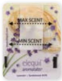
Lavender-Sandalwood Lavandula angustifolia-Santalum album

Elequil.com is our consumer website that allows patients to leave your healthcare facility and continue use by ordering Elequil direct.