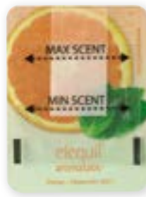
Orange-Peppermint Citrus sinensis-Mentha piperita